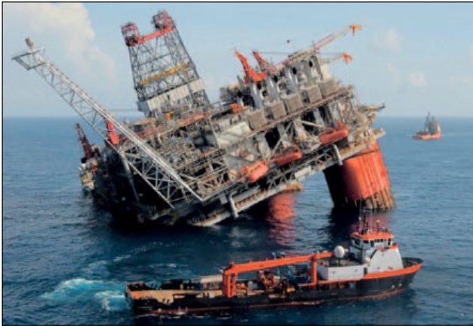
Figure 2. Offshore drilling rig after an accident in 2005 Rysunek 2. Morska platforma wiertnicza po wypadku w 2005 r.

the welds, indicating poor quality workmanship. However, the registry commission (maritime registry), which had inspected the platform shortly before the incident, found no breach of structural integrity and recommended permanent repairs with the issuance of an official PDQ suitability certificate. This accident was attributed to the negligence on the part of welders, inspectors, ultra-sonic diagnostics specialists, and controlling state authorities.