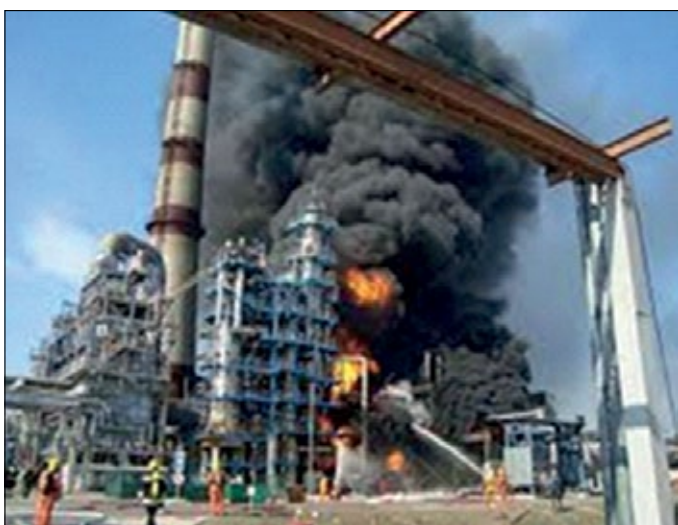
Figure 3. Accident at oil refining facilities Rysunek 3. Wypadek w rafinerii ropy naftowej

Figure 3 shows an accident at an oil refinery in Russia. The catalyst for such accidents is most often insufficient level of responsibility and qualification of managers and executives, ineffective operation of production control services, erroneous actions by employees during emergency situations, and neglect of safety techniques.